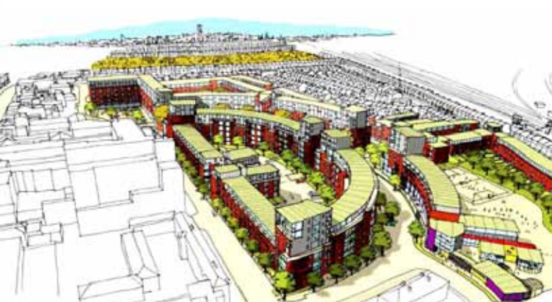
Green Man Lane - Regeneration