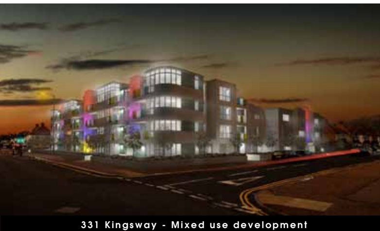
331 Kingsway - Mixed use development