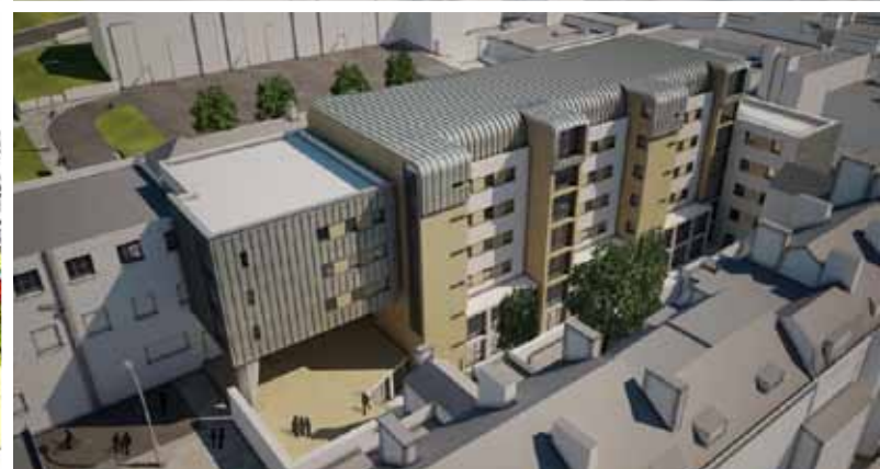
Sussex Place - Student halls development