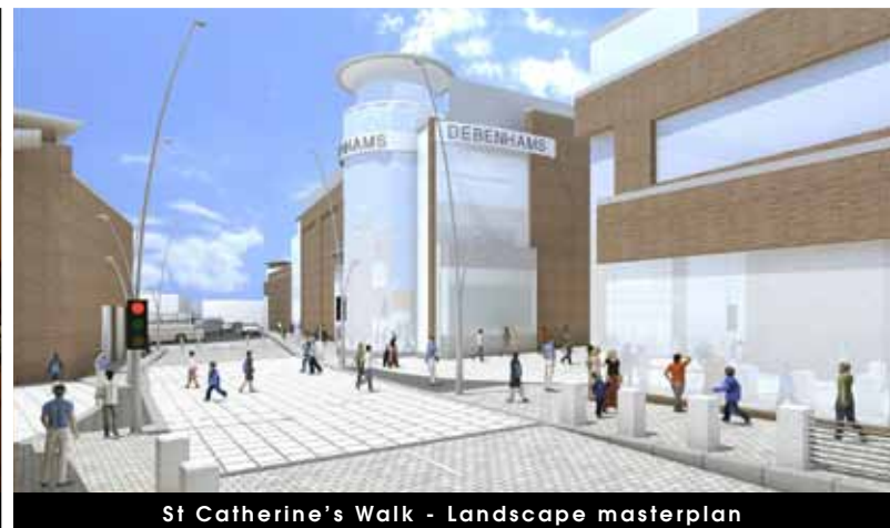
St Catherine's Walk - Landscape masterplan